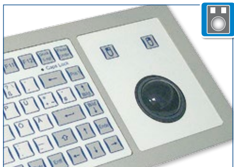
TKF-085a-TB38-MODUL with integrated trackball