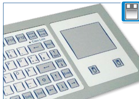
TKF-085a-TOUCH-MODUL with integrated touchpad