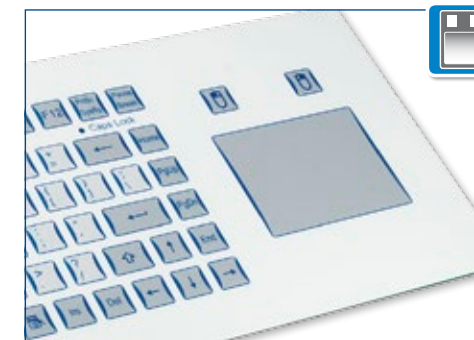
TKF-085b-TOUCH-MODUL with integrated touchpad