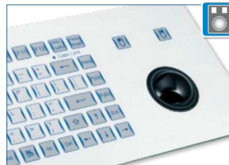
TKF-085b-TB38-MODUL with integrated trackball